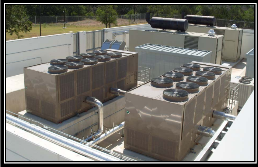
Generators and Chillers