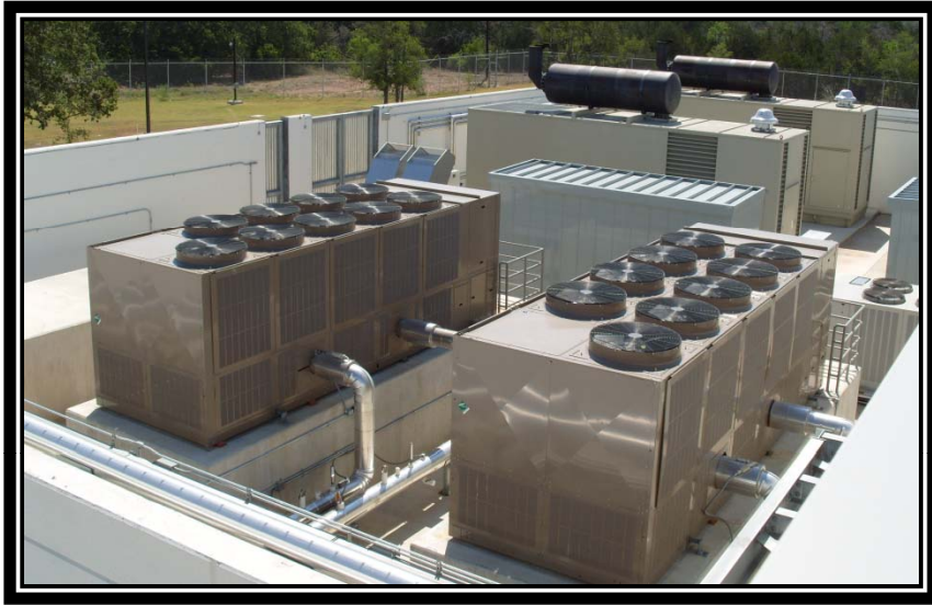
Generators and Chillers