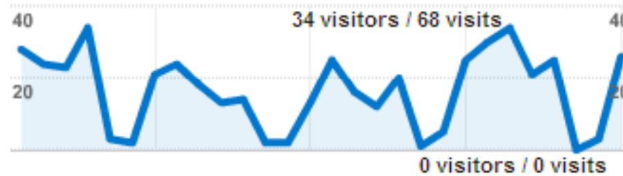
Visitors to Portal