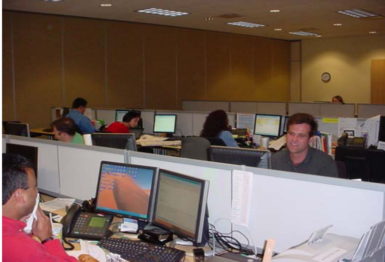
Nodal War Room